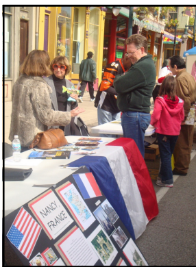
Nancy sister city table at Findlay Market.

On October 24th and 25th, the historic Findlay Market graciously hosted "Sister Cities Weekend" in Over-the-Rhine. The Cincinnati USA Sister City Association and its Sister City member groups partnered with Findlay Market to present a free event that was open to the public. Representatives from the Cincinnati USA Sister City Association and all seven Sister City member groups including Gifu, Kharkiv, Liuzhou, Taipei-Hsien, Nancy, Munich, and Harare were there to share information about Cincinnati's sister cities, hand out food and souvenirs, and make crafts from their countries.