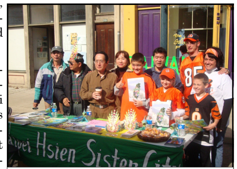
Taipei-Hsien group posing with Findlay market-goers and their crafts.